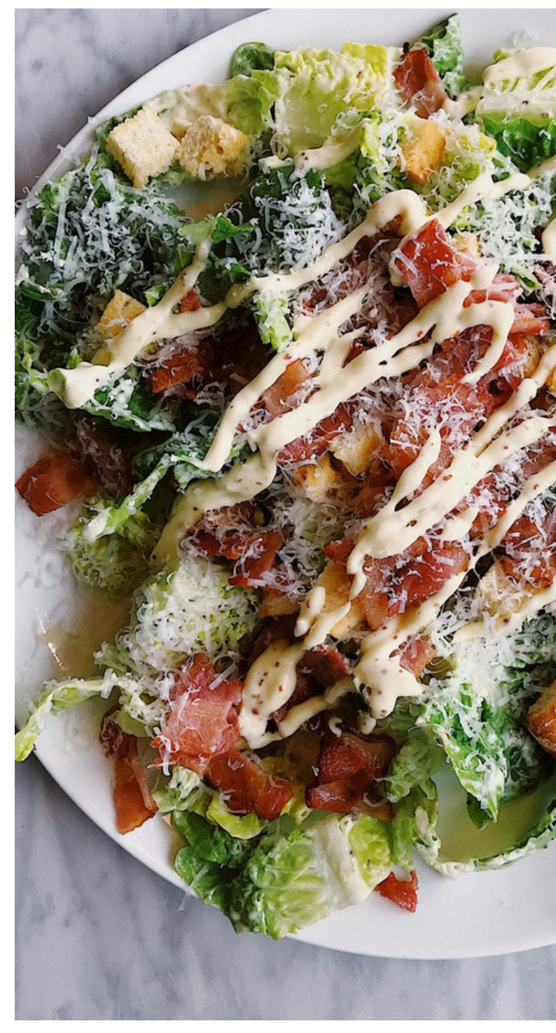
Upgrade to large bowls for $50.

Romaine, Feta cheese, olives, tomatoes, cucumbers, red onions, bell peppers and Greek dressing V (F+)